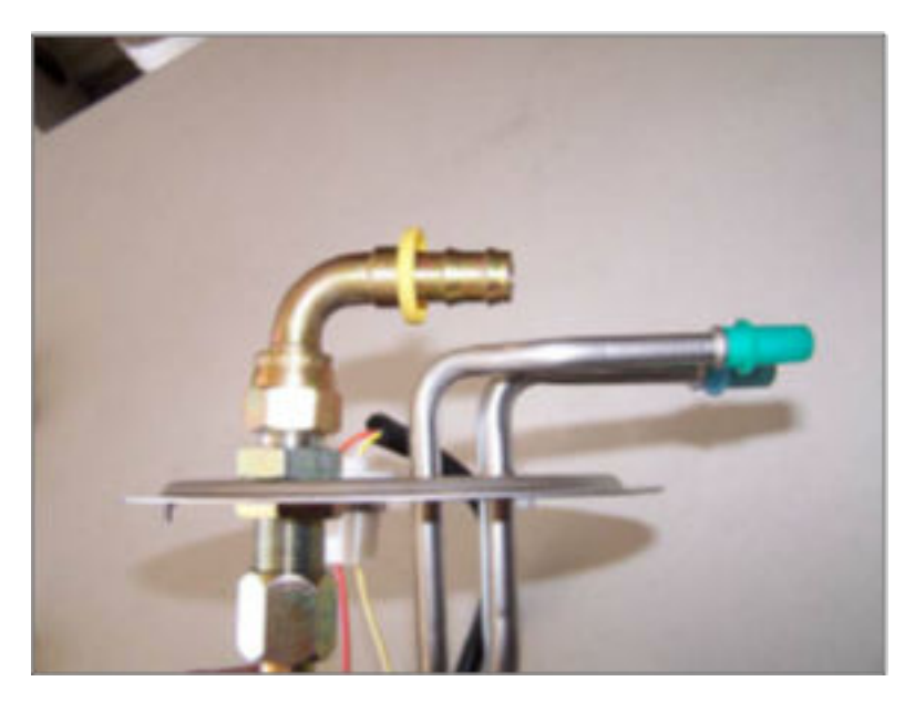
Installation of this fitting requires some muscle. We recommend keeping the fitting cool and the hose warm until you're ready to work with them. It is sometimes beneficial to put the end of the hose into a bucket of hot water just prior to installing the fitting as this helps to soften the hose temporarily, making it easier to work with.

When installed in the truck, the 90° hose end will be pointing in the same direction as the stock pickup and return lines as shown in the picture to the right.